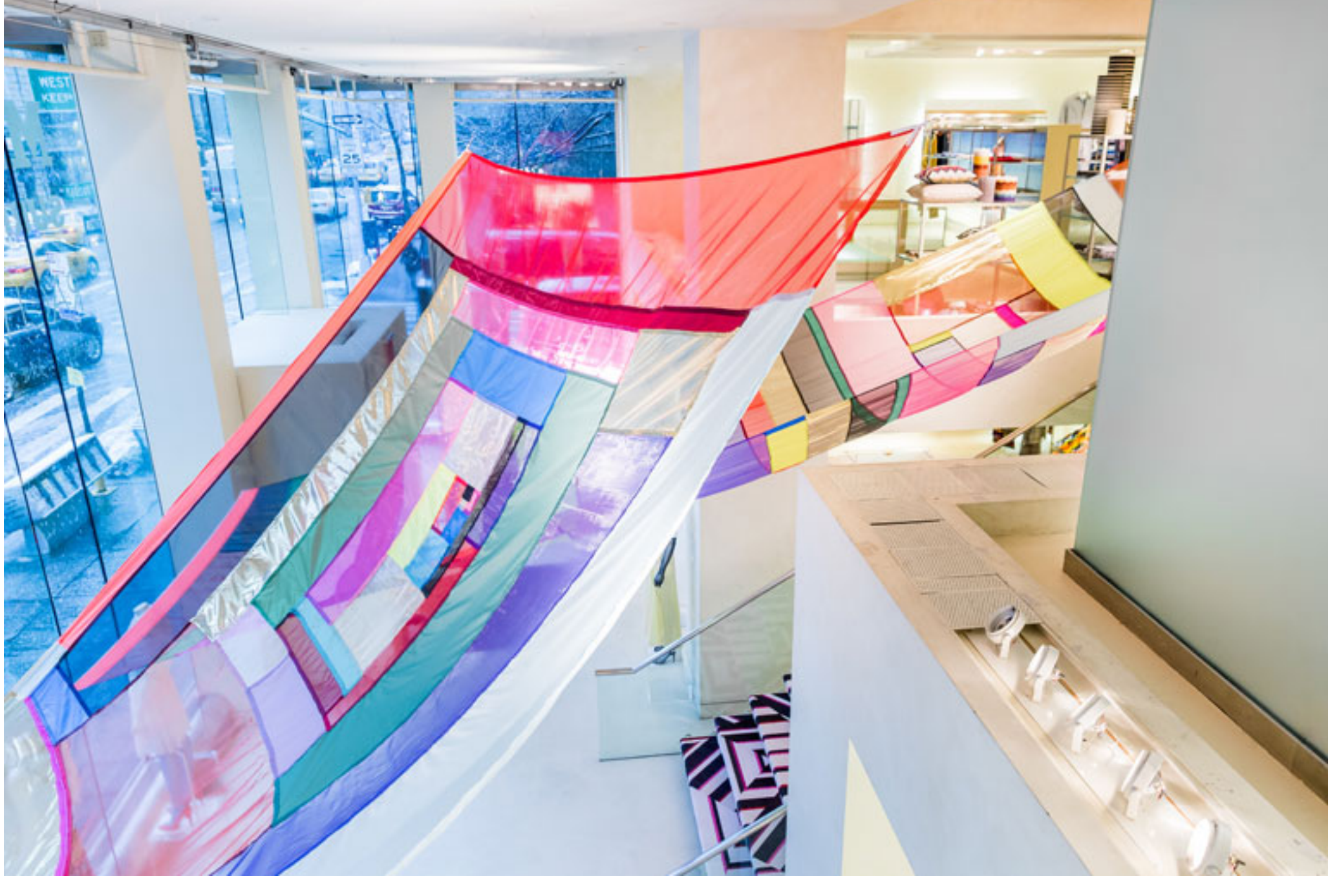
"Dreams of Being" at Missoni in New York. ID: How do color, pattern, and scale factor into your pieces?