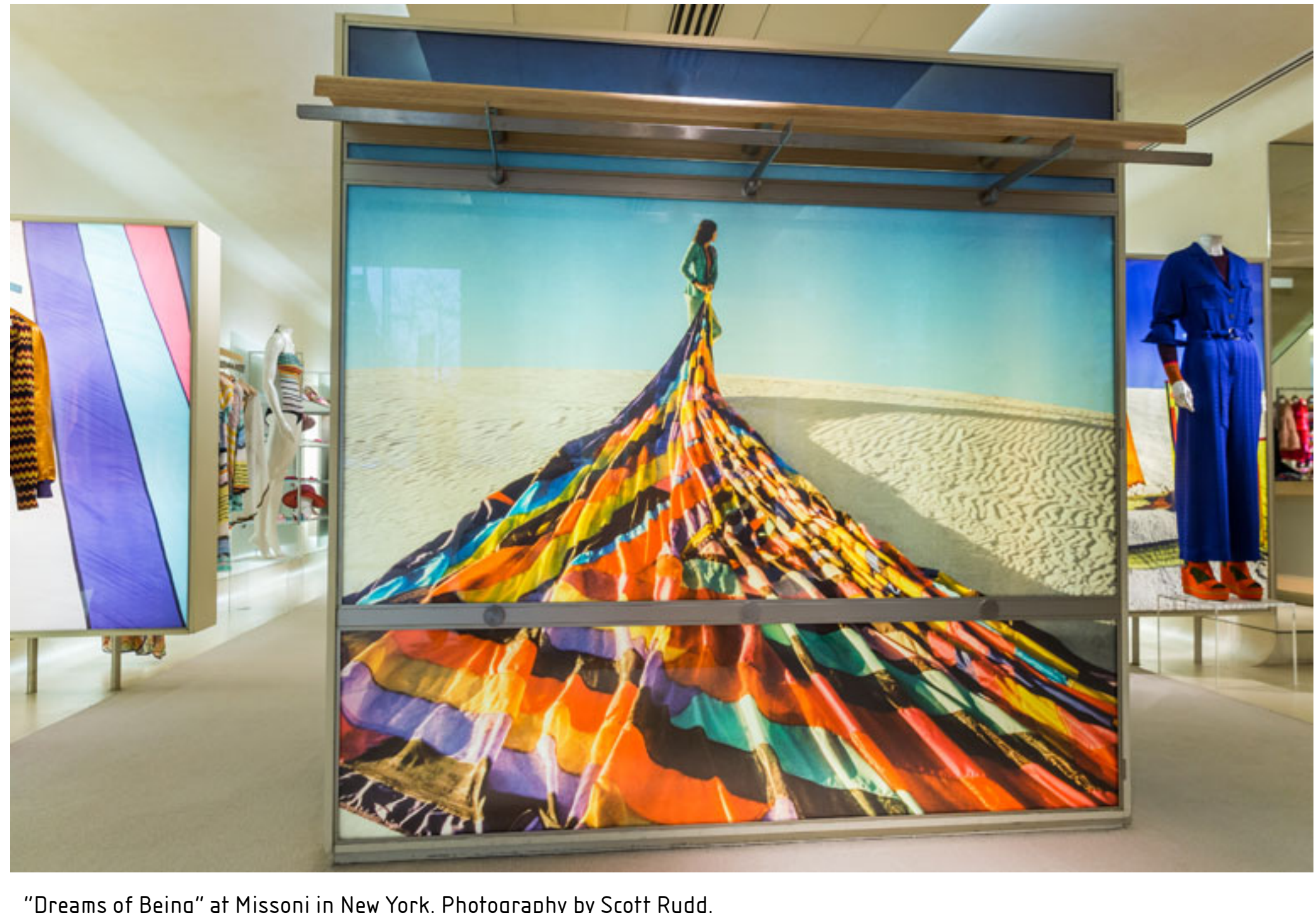
"Dreams of Being" at Missoni in New York.